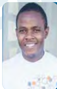
Ian Mdoma Vision Institute of Professionals from Nairobi