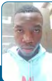
Clinton Amulavu Vision Institute of Professionals from Nairobi