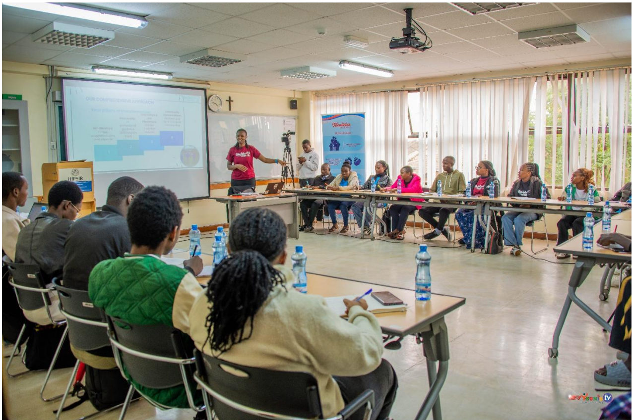
2026 Scholars during their induction sessions at Hekima University College

Currently, Tuendele Foundation supports 41 active scholars and maintains engagement with 13 alumni , who continue to play an important role within the broader Tuendele community as emerging leaders and role models.