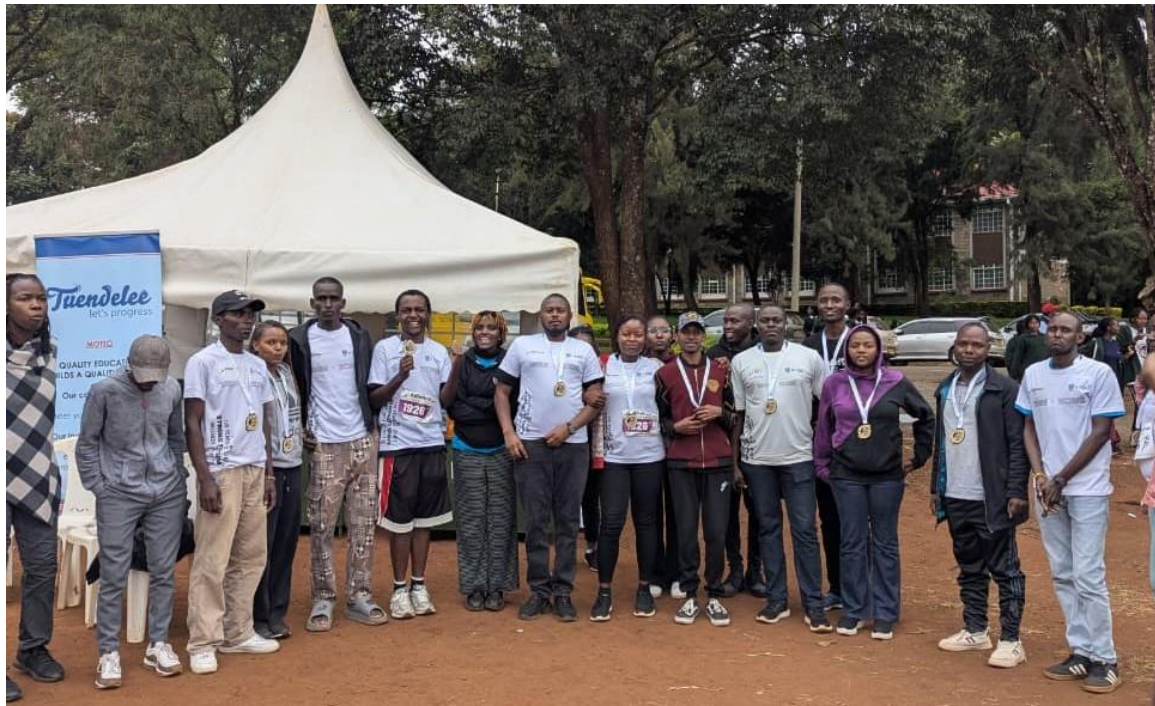
The Tuendelee Foundation team during the Alliance Classic Run 2026, promoting access to quality education through collective action and community partnership.

For Tuendelee scholars, the event offered more than a fundraising opportunity. It provided a platform to experience teamwork, volunteerism, and servant leadership while reinforcing the Foundation's core value of giving back to the community. Scholars actively participated alongside Foundation staff and partners, demonstrating their commitment to supporting educational opportunities for others.