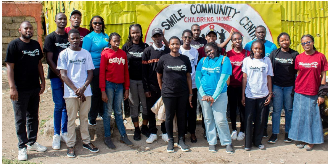
The Tuendelee Foundation team during a visit to Smiles Children Centre